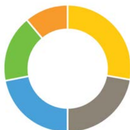
Q3 16 YTD Gross Revenue by Business Operating Unit