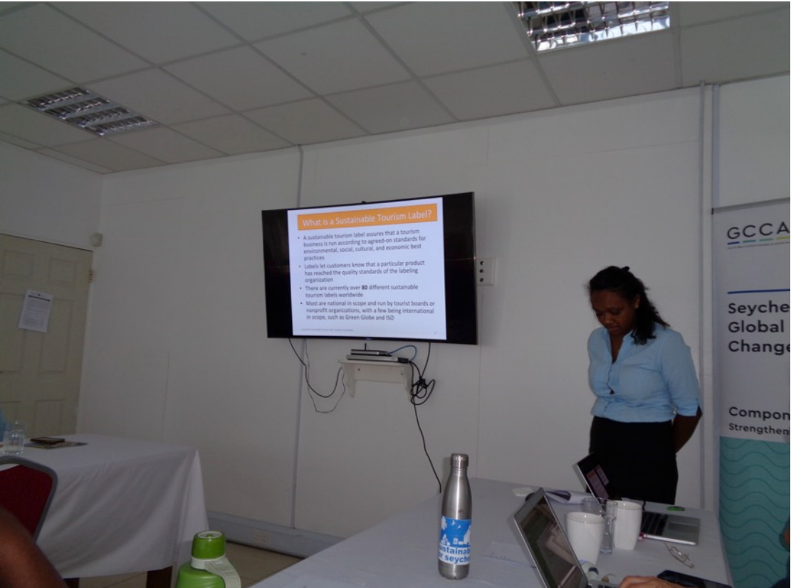
Top: presentation by Philomena on climate change impacts on tourism. Bottom presentation about the Seychelles Sustainable Tourism Label.