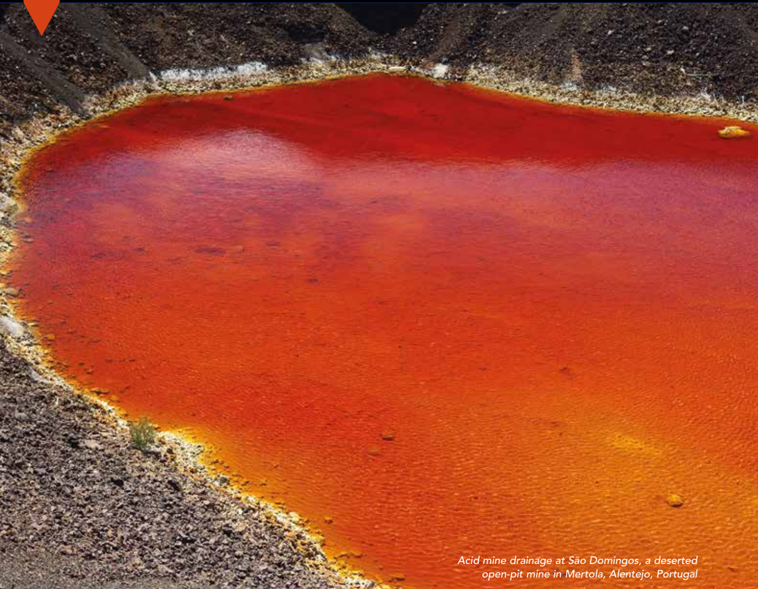
Acid mine drainage at São Domingos, a deserted open-pit mine in Mertola, Alentejo, Portugal