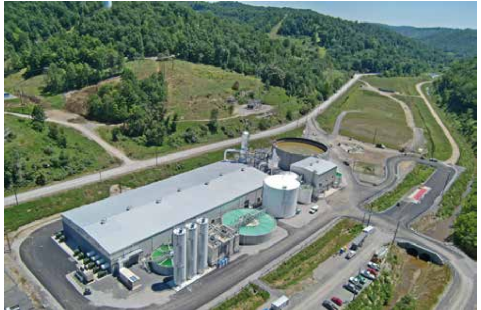
A Veolia Zero Liquid Waste facility

According to Watson, poor water management can lead to limitations on the scale of an operation – if there is too little water to operate or too much water to store, water